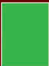
ZINC CHROMATE PRIMER GREEN