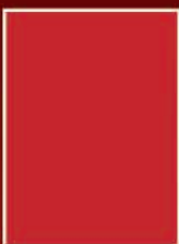
RED OXIDE PRIMER